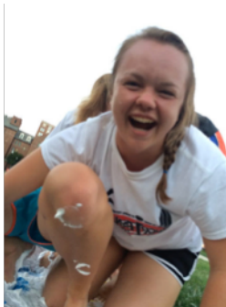
Shaving Cream Twister!

We cast the nets wide during CRUSH Week, and we are currently seeing the fruit as we invite the 600+ students who indicated interest, into small groups, Household dinners etc... and personal relationships.